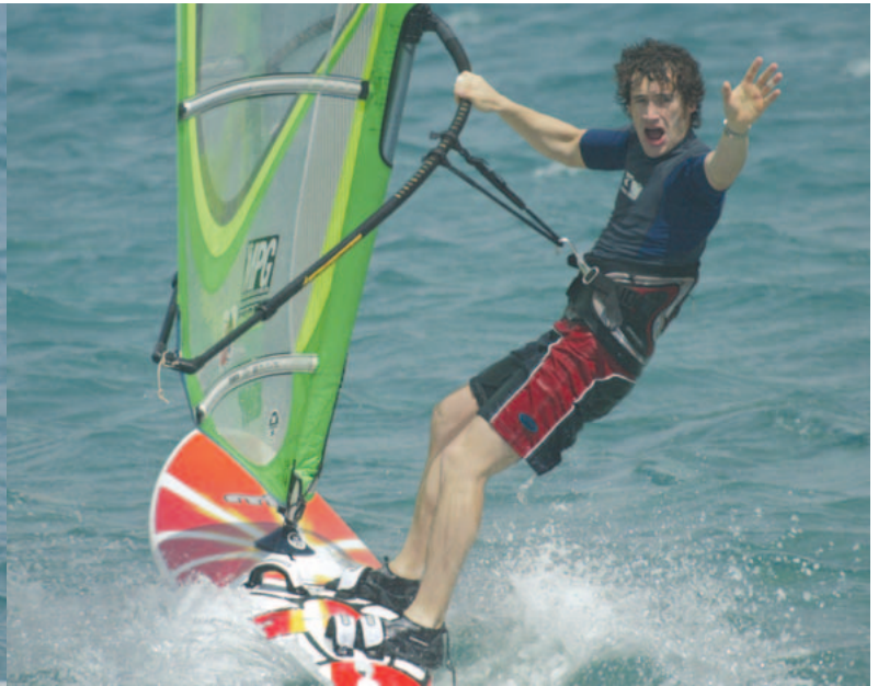
brands, so long as it's rigged right and the lines are in the right place.