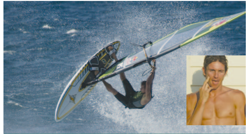
Australia's Jason Polakow, many times World Wave Champion, showing how he does it, and with a message for the sceptics.