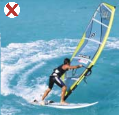
Failing to rake the rig back this far will result in the wind pushing the rig right into you and knocking you off backwards.