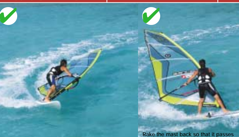
Rake the mast back so that it passes through eye of the wind.