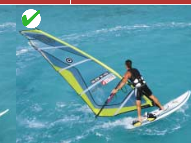
With the rig so far back, any surge of power into the sail can be exhausted by sheeting out.